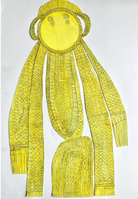
Bärbel Lange, BÄR CUTOUT , 2019