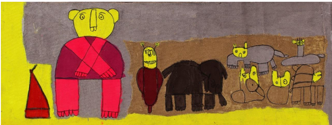
Bärbel Lange, TEPPICH , o.A., Photo: Enno Jaekel ©Kunsthhaus KAT18